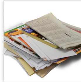
Newspaper, Magazines, and Junk Mail