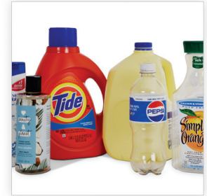
Plastic Bottles (1 & 2)